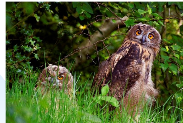
This is a picture of two young Eurasian Eagle Owls.